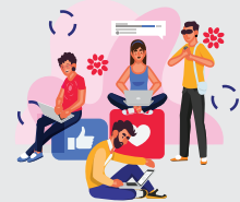
SOCIAL MEDIA MANAGEMENT