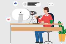
VIDEO SHOOT & ASSISTANCE