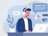
TELE / MARKETING SUPPORT