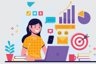
DIGITAL MARKETING SUPPORT